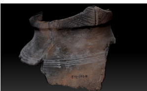
Top to bottom: photo of original vessel from the Museum's collection; photo of vessel as scanned; screenshot of un-textured 3D model; screenshot of final textured 3D model