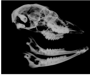
Digital radiograph of white tailed deer skull and mandible. Scan completed by Zoe Morris at the SA Ancient Images Lab.